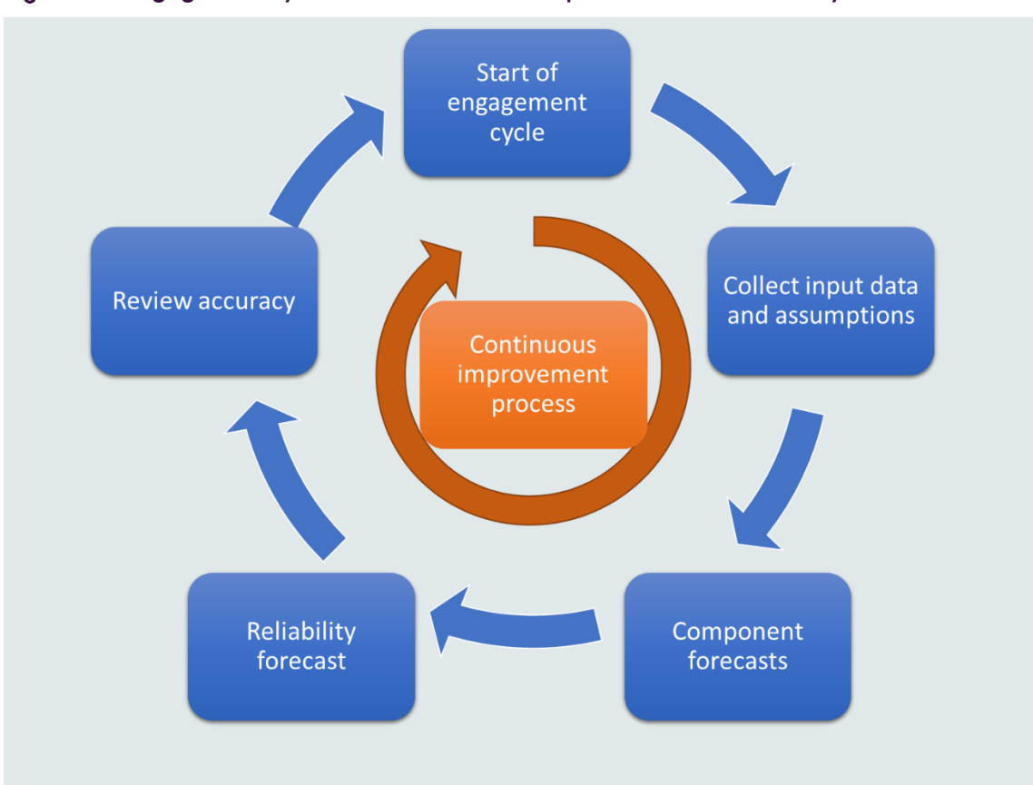
Figure 1 Engagement cycle – commences fourth quarter of each calendar year

Within the development of the annual IASR, AEMO will publish a timeline for stakeholder engagement on the development of key inputs and assumptions.