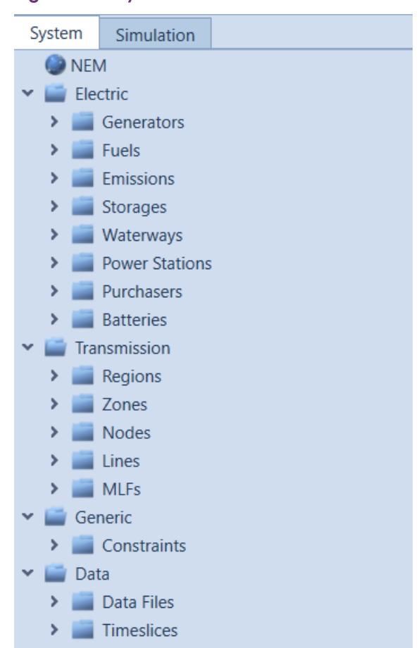
Figure 2 System tab of the .xml file

7. Open the .xml file in PLEXOS. The model consists of System and Simulation tabs, as shown in Figure 2. The PLEXOS System tab comprises all objects, as well as their memberships and properties. The PLEXOS Simulation tab contains the model object and all the settings used in the simulation.<sup>5</sup>