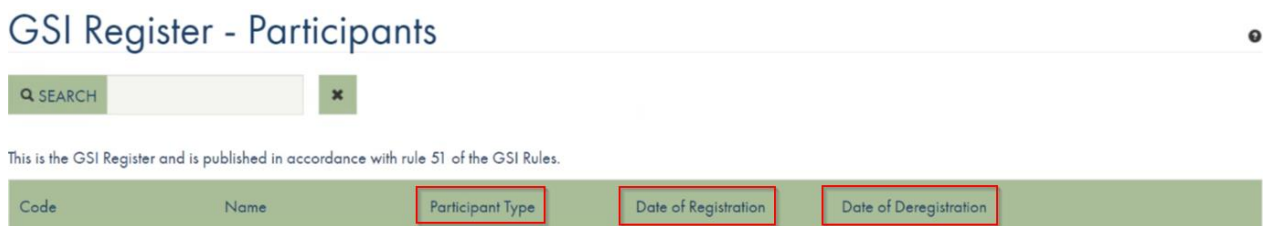
Figure 2 Participants Section - After