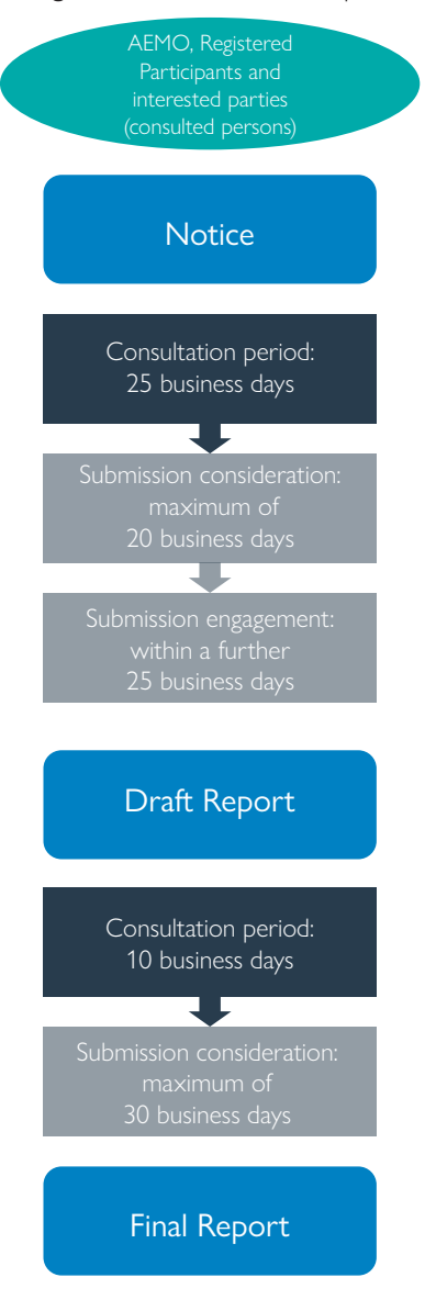
Figure AI: Funded augmentation consultation process