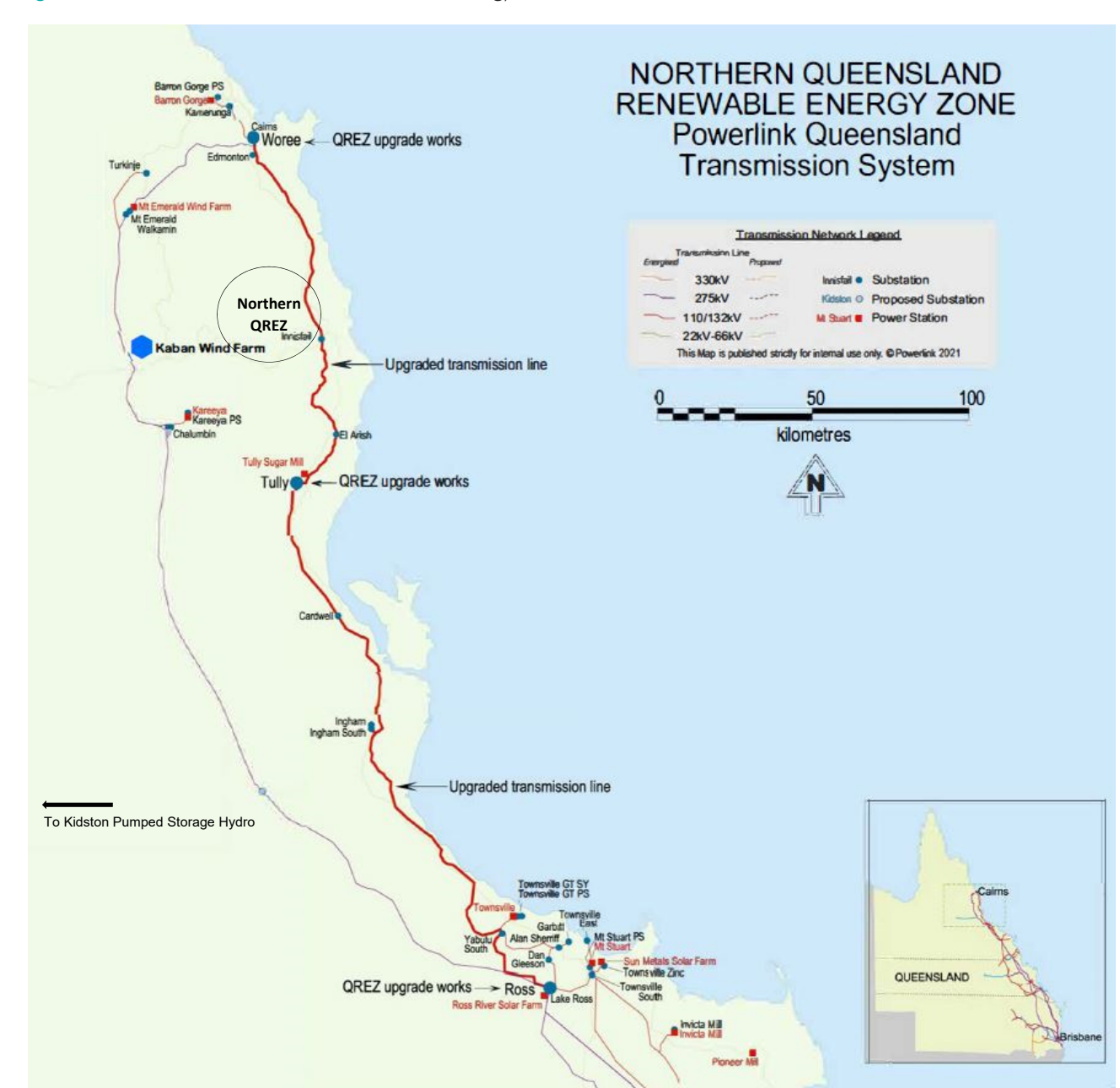
Figure I Northern Queensland Renewable Energy Zone

Without the 275kV upgrade, future VRE generators (post Kaban Wind Farm) will require additional investment in remediation to be compliant with Generator Performance Standards. In this context, the proposed capital expenditure has been assessed as prudent given that the benefits to the electricity market (as a whole) significantly exceed the cost of the capital works that Powerlink is required to undertake as part of this upgrade. Further, the market benefits associated with reduced network losses and improved reliability of supply to Cairns<sup>8</sup> are expected to result in additional benefits. Collectively, these will deliver positive long term benefits to electricity consumers.