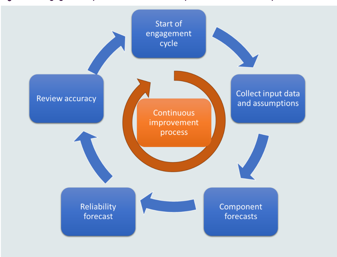
Figure 1 Engagement cycle – commences fourth quarter of each calendar year

Within the development of the annual IASR, AEMO will publish a timeline for stakeholder engagement on the development of key inputs and assumptions.