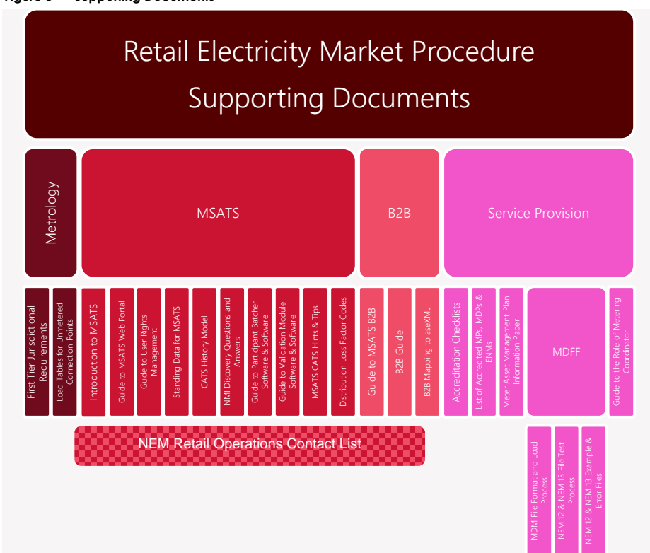
Figure 3 Supporting Documents

In addition to the Retail Electricity Market Procedures, AEMO has published a number of documents that explain, or provide additional information to enable Participants to fulfil their obligations under the NER and procedures under the NER. How these fit in with the Retail Electricity Market Procedures is depicted in Figure 3, using the same colour coding for ease of reference: