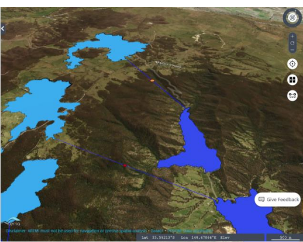
Detail of upper & lower reservoirs + tunnel route