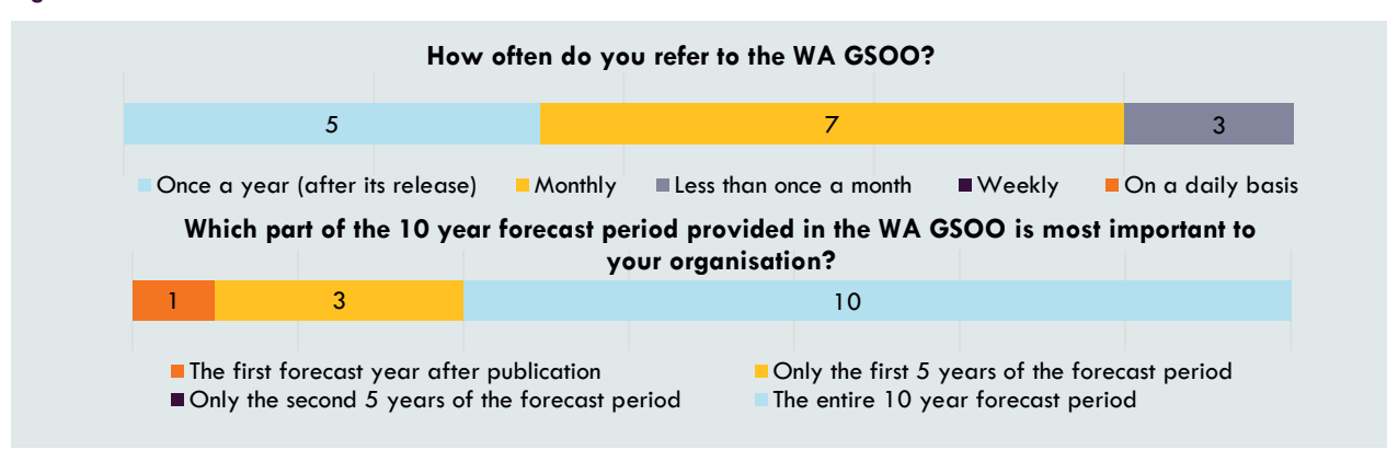
Figure 2 How the WA GSOO is used*